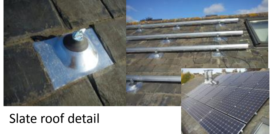
Slate roof detail