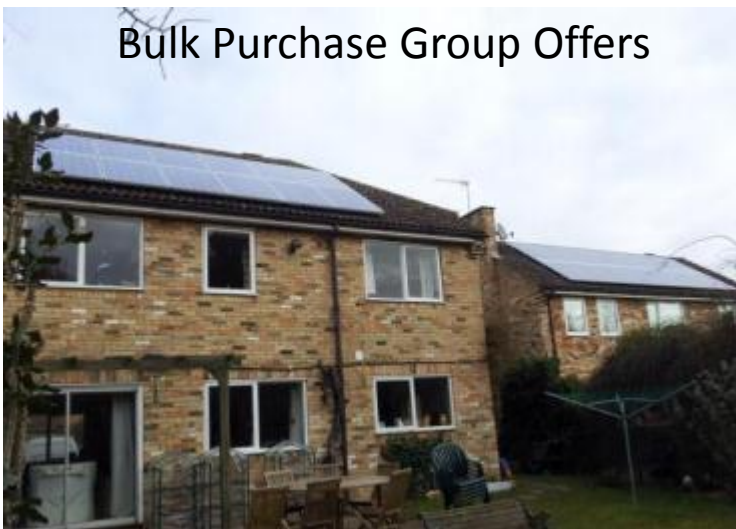
Bulk Purchase Group Offers