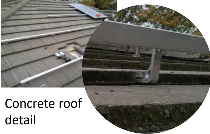
Concrete roof detail