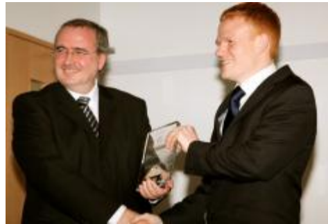
We're award winning