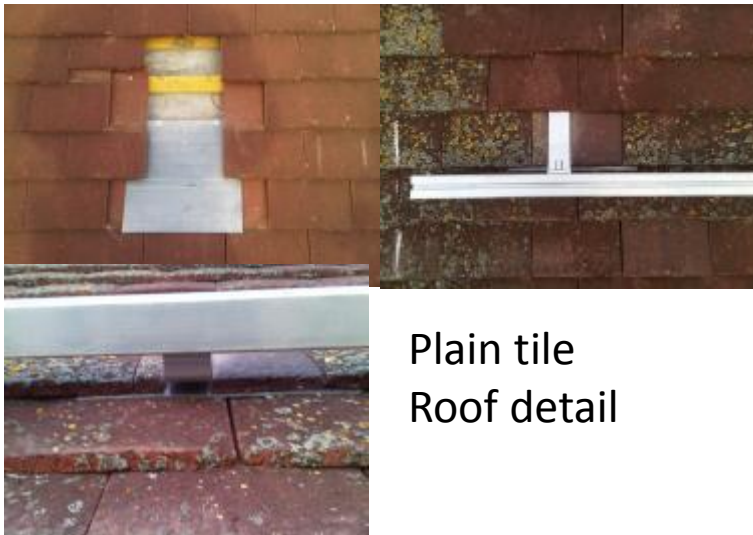
Plain tile Roof detail