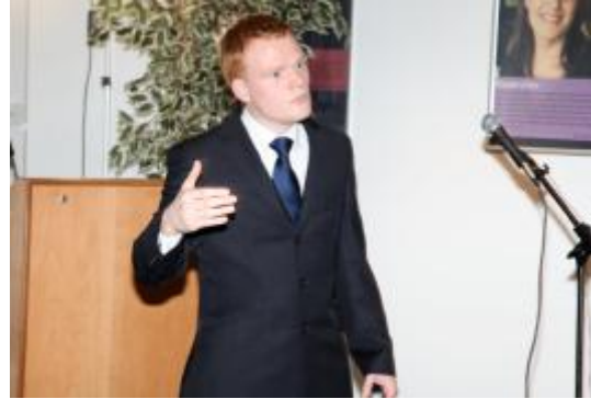
We give talks & presentations