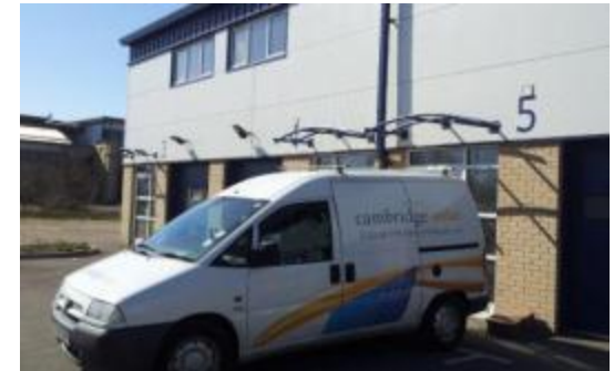
We organise energy open days