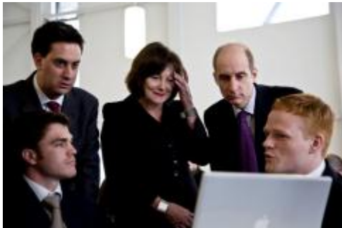
We represent small business

Let us know if we can help you with any local event you are organising