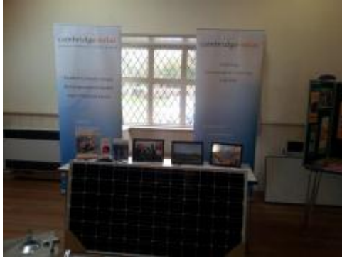
We attend local events